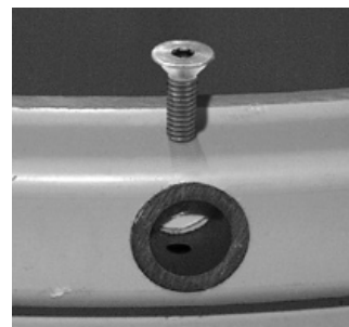
Bolt catch on 30-in. riser